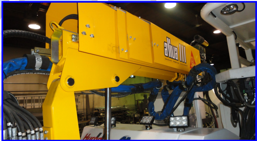
Figure 11 Aliva 302 boom retracted for driving.