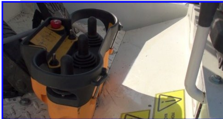
Figure 6 Remote Joystick Operation and Controls