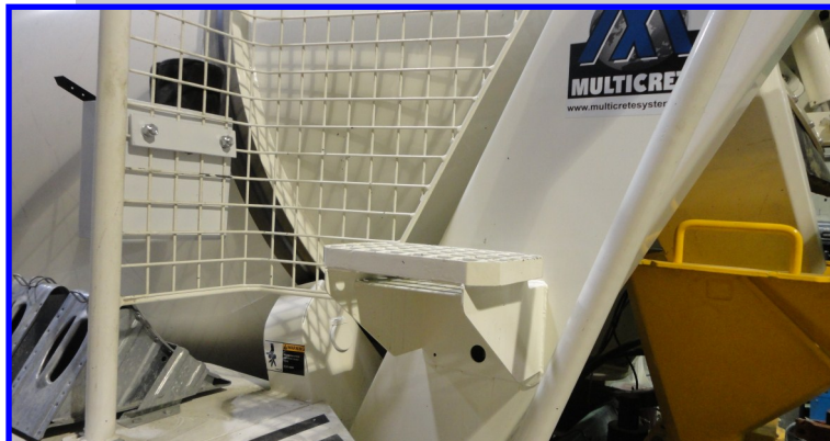
Figure 9 Easy Safe-Steps to access top of Mixer Drum

Experience has shown up to 10 times less wear on the steel plates, depending on material, output capacity, hose diameter and compressed air supply! This again leads to less down time and wear cost and therefore to a more economical spraying operation.