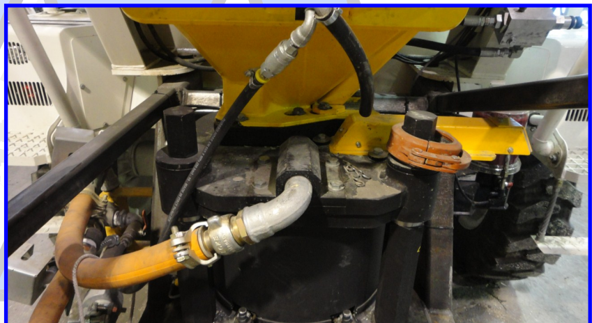
Figure 8 Aliva 257 Shotcrete Machine.