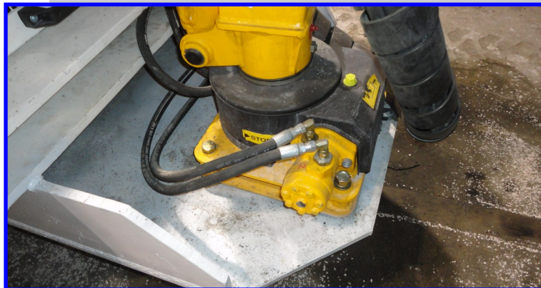
Figure 12 Aliva 302 Mounted in front of Engine Compartment

Reach, rotation and precision all contribute to remotely operated quality application of shotcrete material to all of those tough to get into places. Safe workers, minimal hazard, correct technique, less waste, more profitability. The Huron 4 application Shotcrete carrier is your answer.