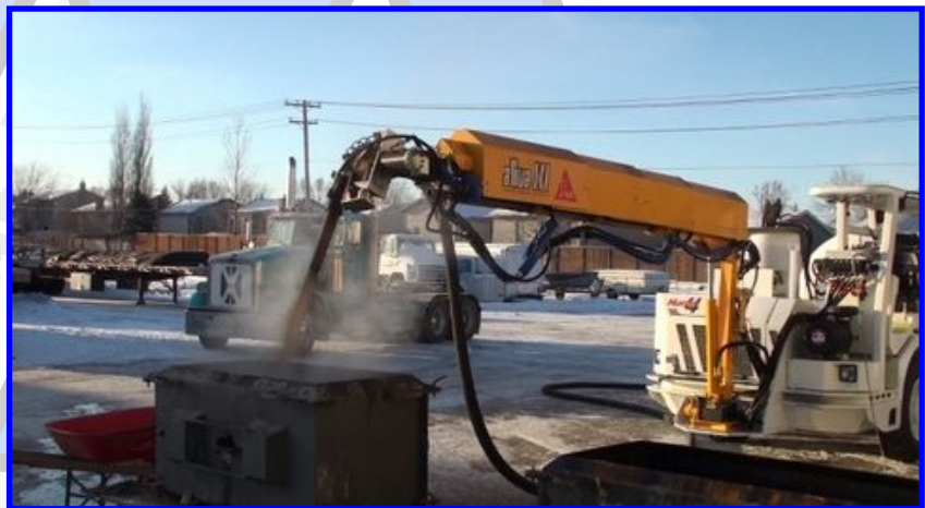
Figure 5 Aliva 302 Spray Arm shooting Shotcrete.