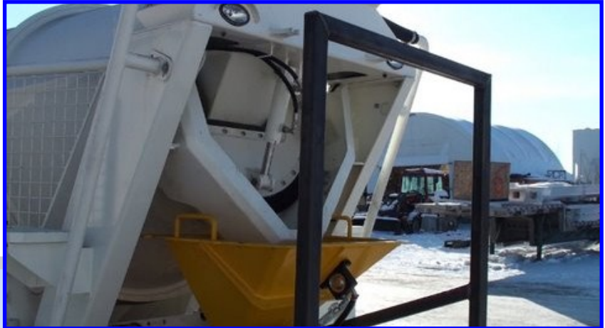
Figure 7 Drum discharge chute to Aliva 257 hopper

The machine is equipped with rotors made of high tech aluminum and is operating with steel - on -steel wear and rotor plates.