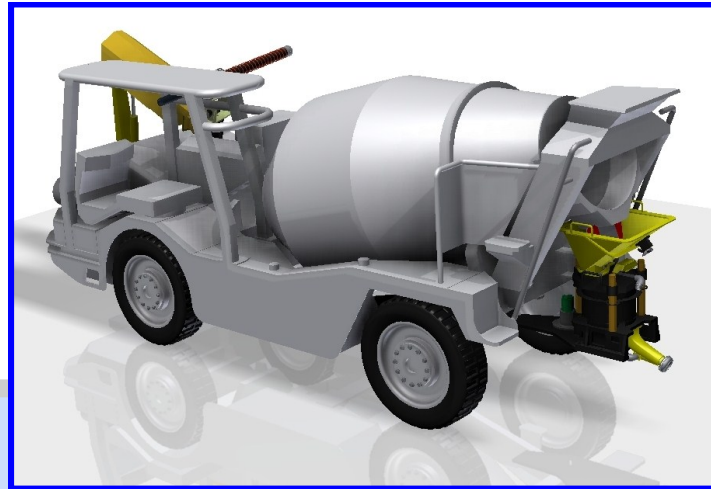
Figure 1 Aliva 302 Spray Boom (front) and Aliva 257 Wet/Dry Shotcrete Machine (rear) assembled on Huron 4 Transmixer Chassis.

Steering type front axle with oscillating assembly. Fixed rear axle.