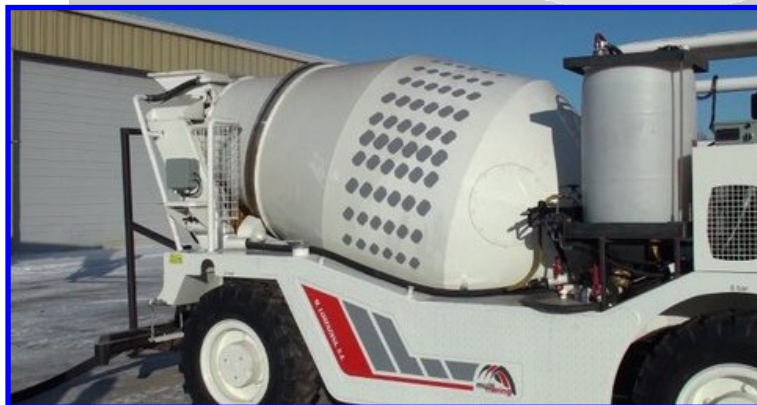
Figure 3 Mixing Drum and Liquid Accelerator Storage