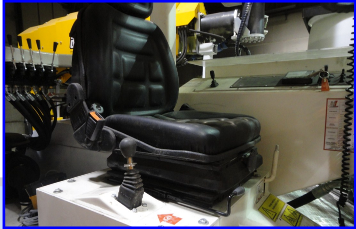
Figure 10 Driving Cage with 180 degree pivot seat