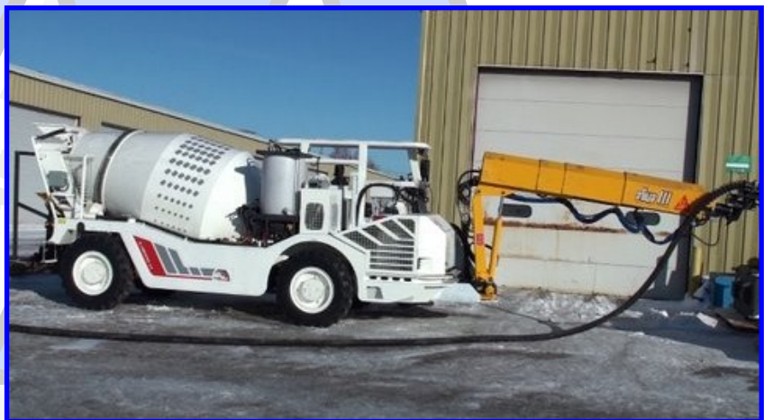
Figure 2 Aliva 302 Spray Arm partially extended